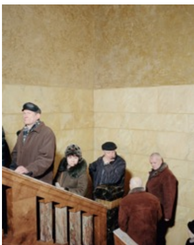
Image 15 Miguel Proença Russian citizens waiting to vote at Russian Consulate in Riga during March 18th Presidential Election, Riga, Latvia, 2018