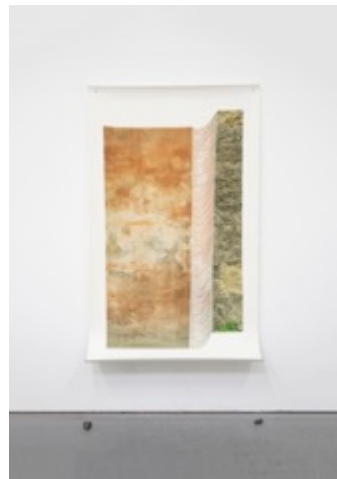
Image 10 Seungwon Jung Installation, digital print on fabric, magnet, paper, rock Memories Full of Forgetting #02 , 2018