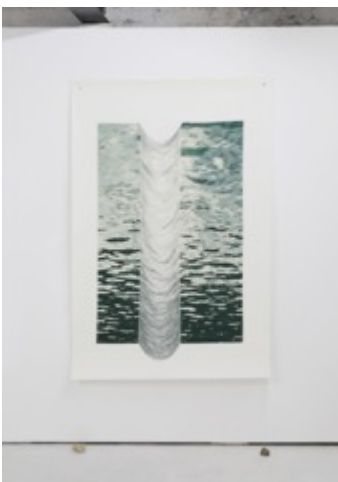
Image 9 Seungwon Jung Installation, digital print on fabric, magnet, paper, rock Memories Full of Forgetting #01 , 2018