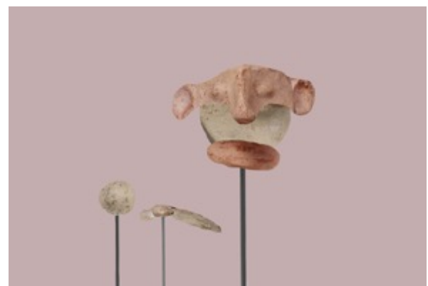
Image 14 Giovanna Petrocchi Museum Display From the series Private Collection , 2018