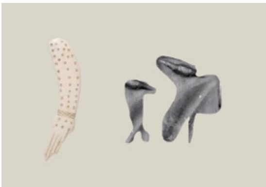
Image 13 Giovanna Petrocchi Classification From the series Private Collection , 2018