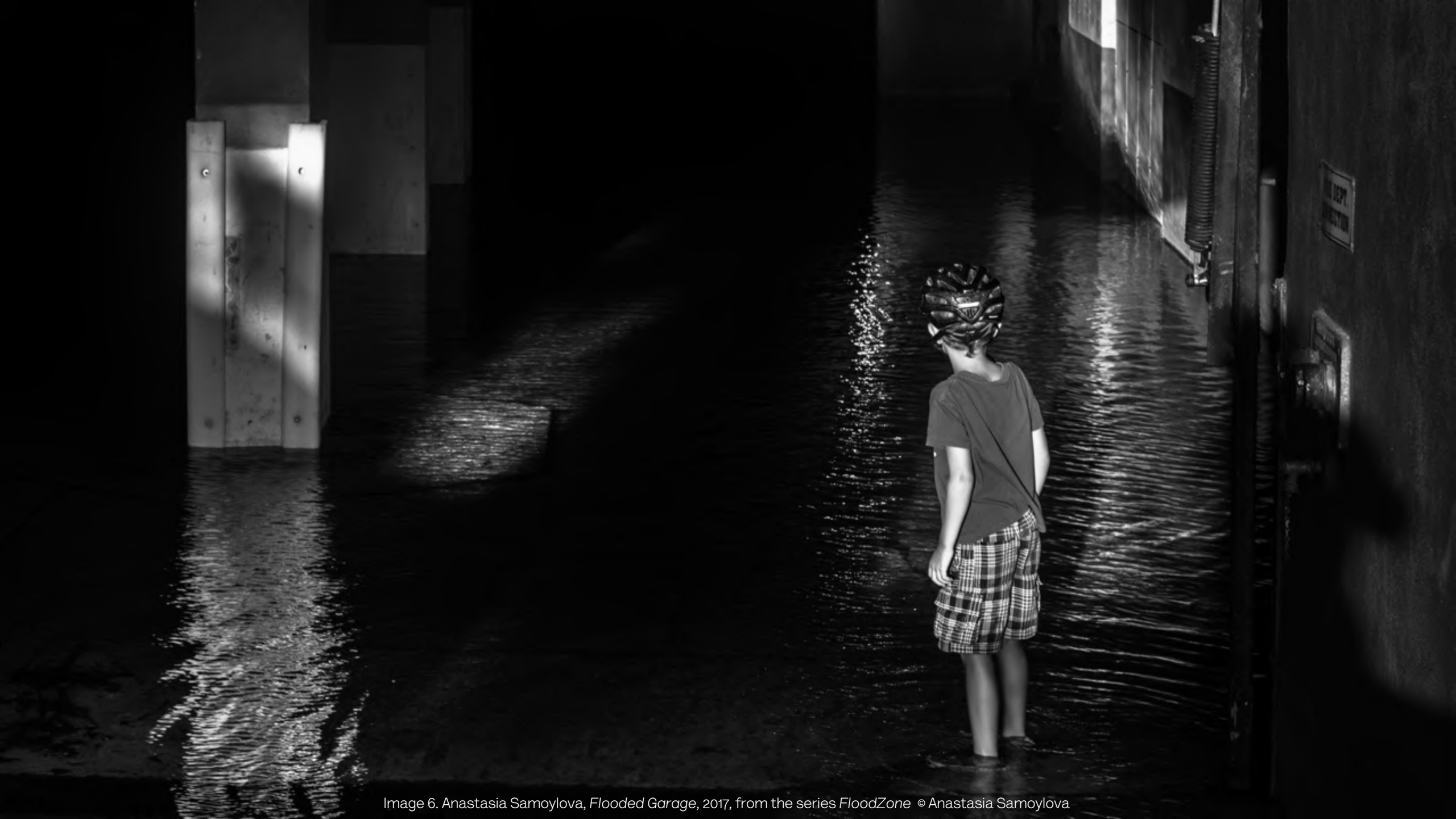
Image 6. Anastasia Samoylova, Flooded Garage , 2017, from the series FloodZone