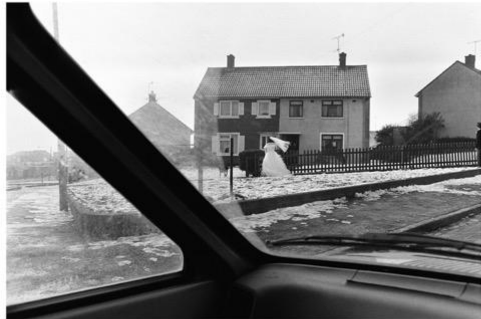
Image 27. Gilles Peress, Whatever You Say, Say Nothing : from the chapter, The First Day © Gilles Peress