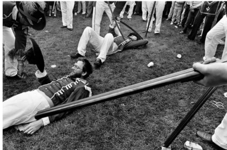
Image 20 & 21. Gilles Peress, Whatever You Say, Say Nothing : from the chapter, A Day to Remember