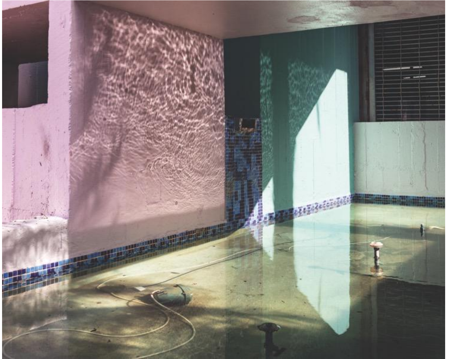
Image 5. Anastasia Samoylova, Fountain , 2017 from the series FloodZone © Anastasia Samoylova