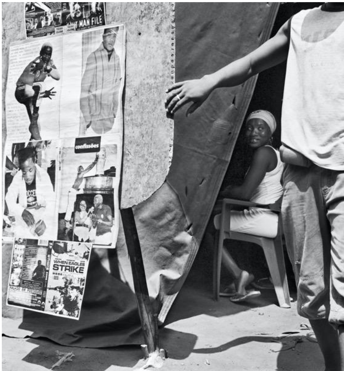
Image 12. Jo Ractliffe, Video club , Roque Santeiro market, 2007 From the series Terreno Ocupado