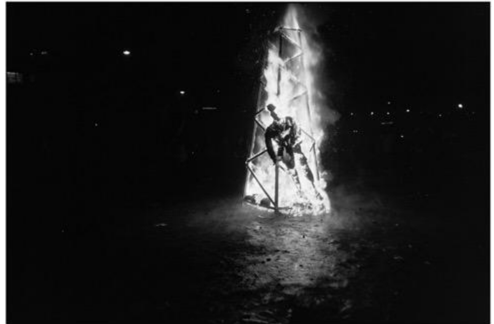
Image 18 & 19. Gilles Peress, Whatever You Say, Say Nothing : from the chapter, The First Day