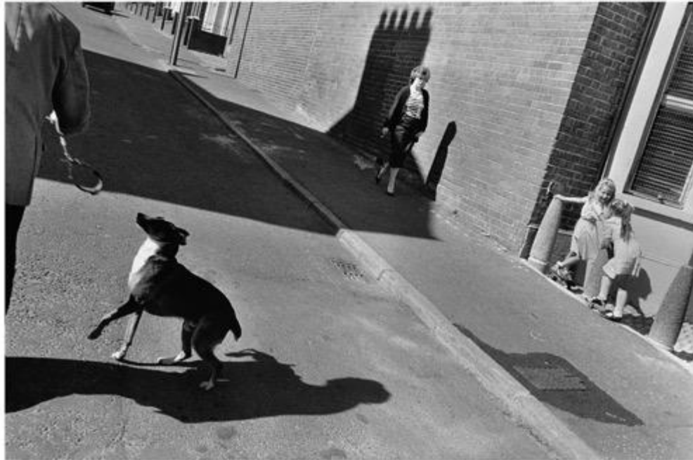
Image 24 & 25. Gilles Peress, Whatever You Say, Say Nothing : from the chapter, Saturday