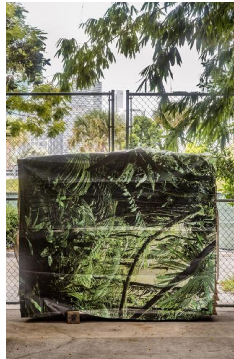
Image 9. Anastasia Samoylova, Camouflage , 2017, from the series FloodZone