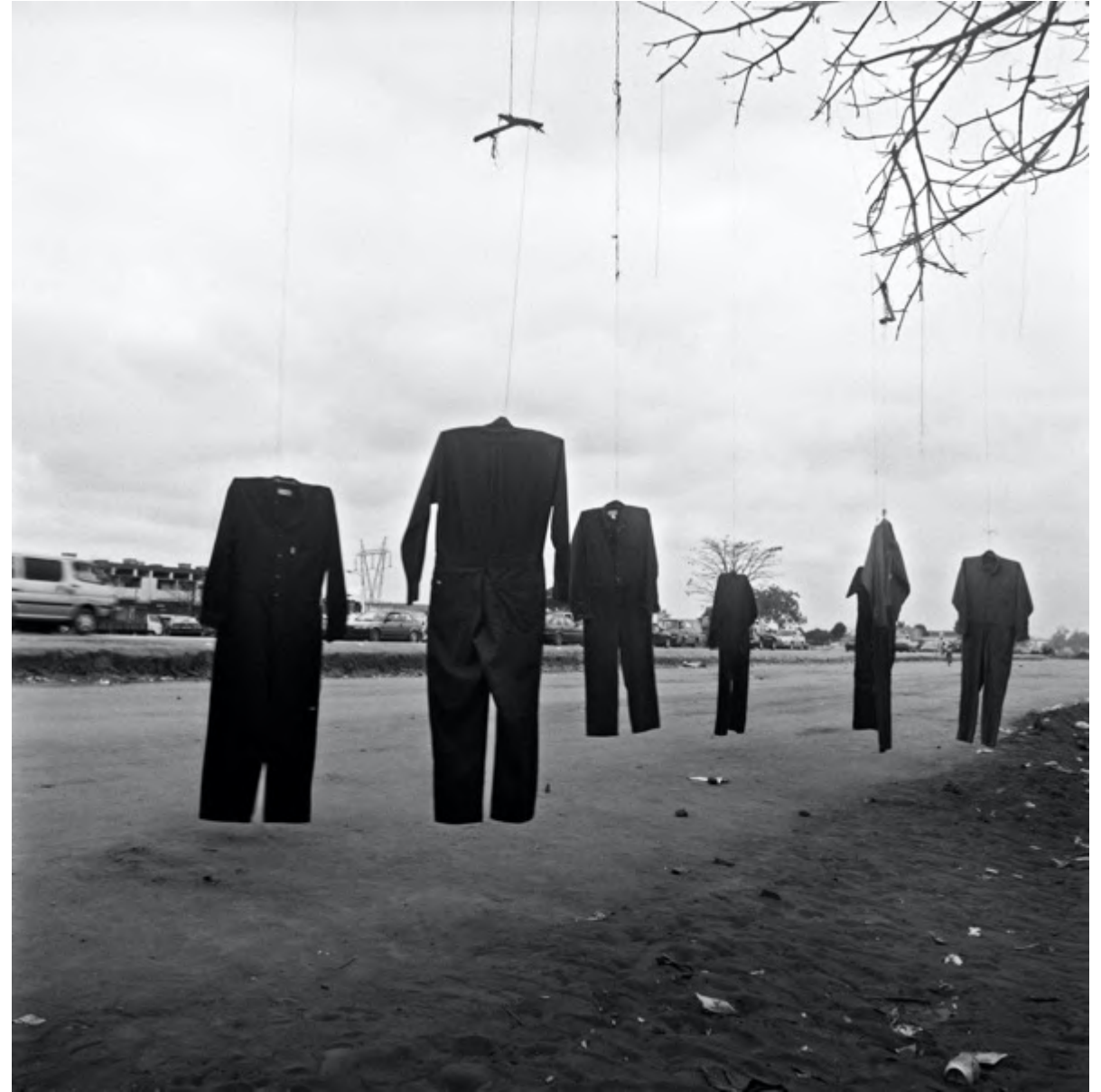
Image 14. Jo Ractliffe, Roadside stall on the way to Viana , 2007 from the series Terreno Ocupado