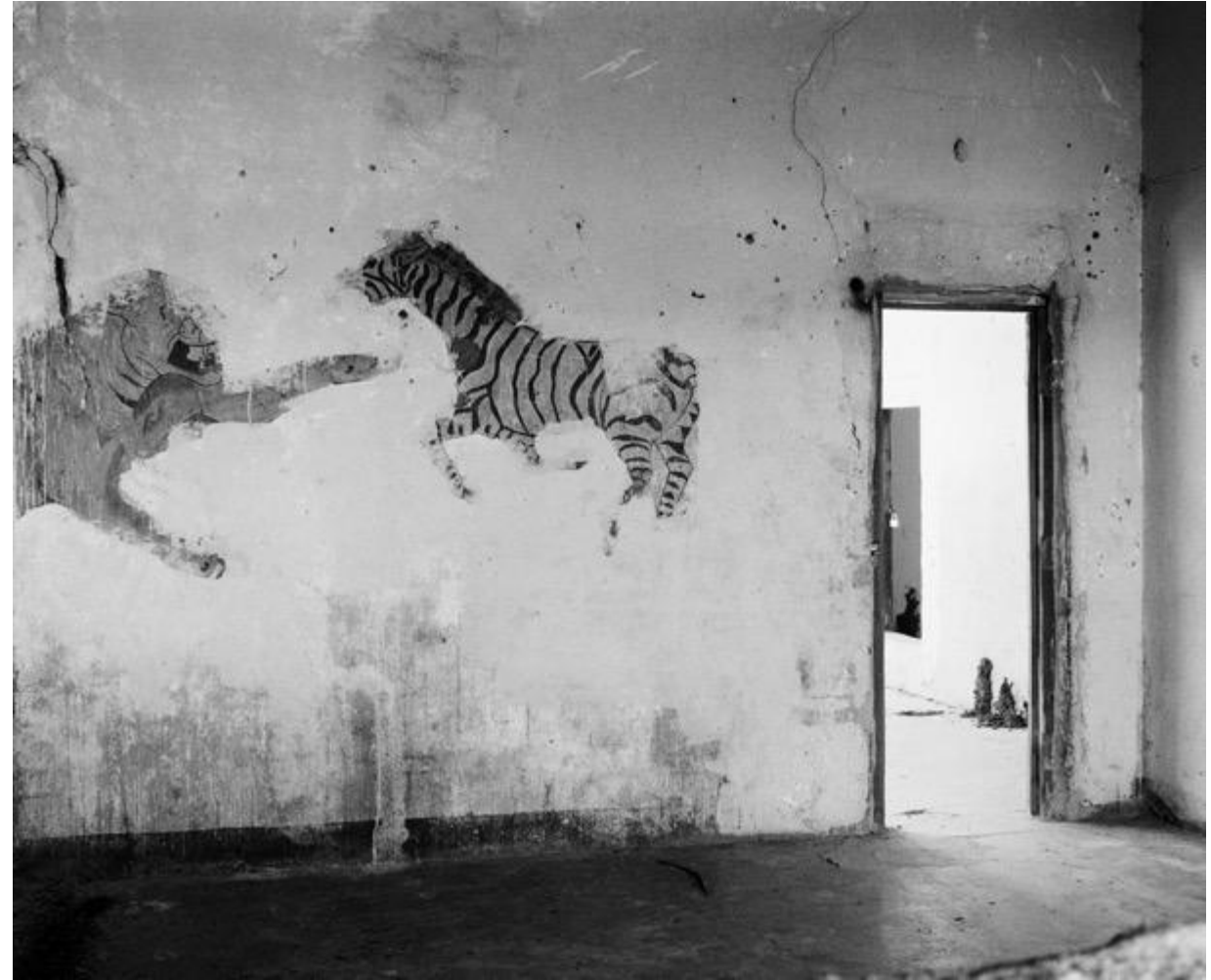
Image 16. Jo Ractliffe, Mural in an abandoned schoolhouse, Cauvi , 2010 from the series As Terras do Fim do Mundo © Jo Ractliffe