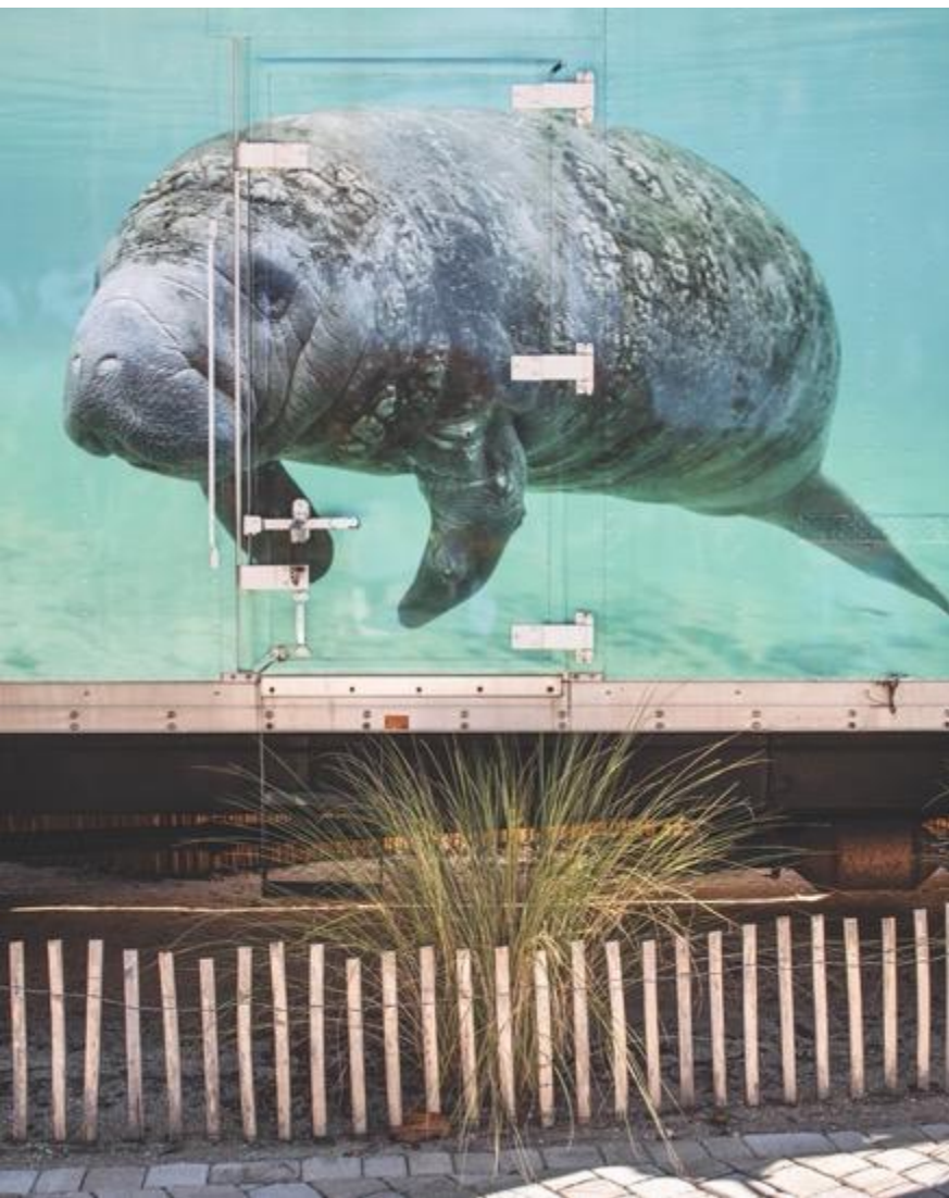
Image 10. Anastasia Samoylova, Manatee Rescue Van , 2019 from the series FloodZone © Anastasia Samoylova