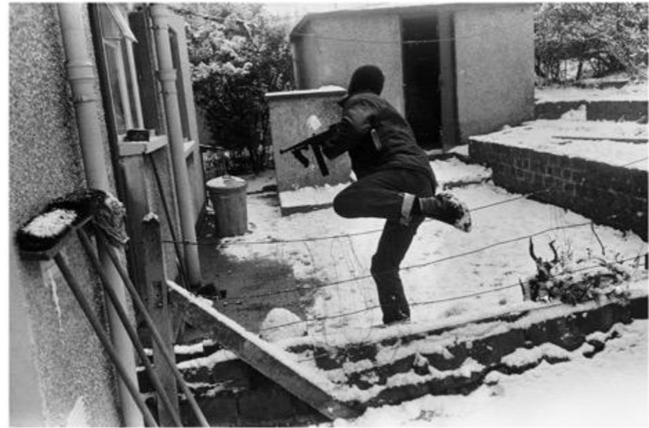
Image 22. Gilles Peress, Whatever You Say, Say Nothing : from the chapter, Days of Struggle