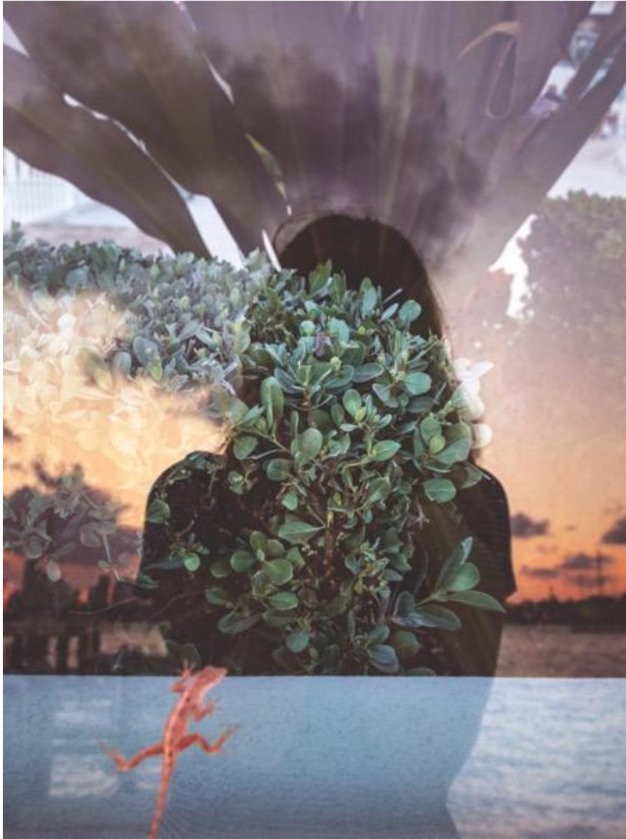
Image 4. Anastasia Samoylova, Biscayne Bay , 2018, from the series FloodZone © Anastasia Samoylova