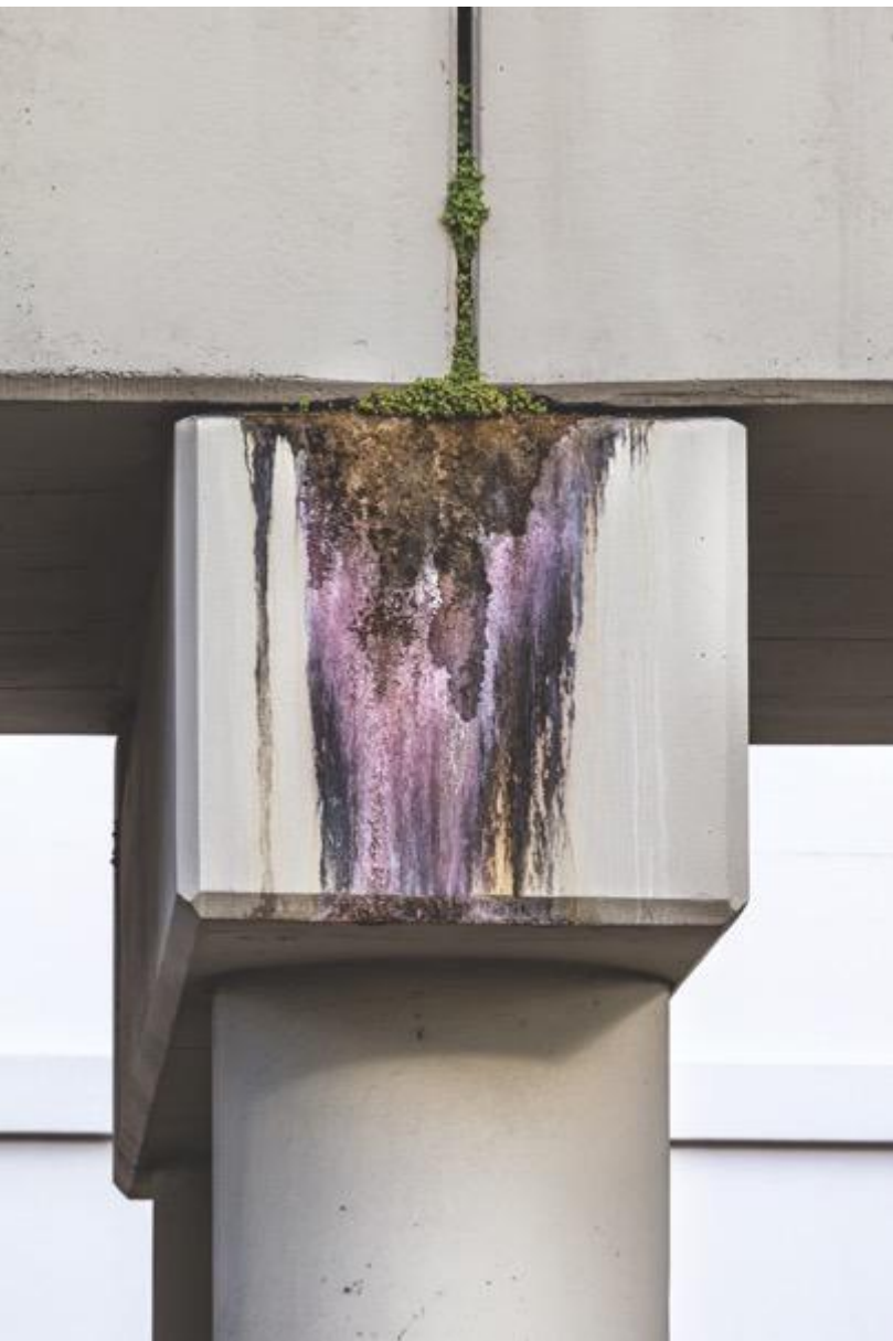
Image 7. Anastasia Samoylova, Concrete Erosion , 2019, from the series FloodZone