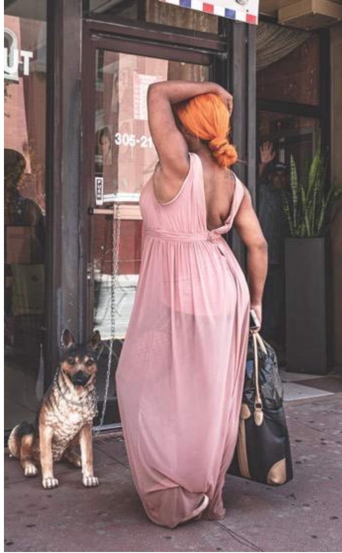
Image 2. Anastasia Samoylova, Barber Shop, Miami , 2018, from the series FloodZone