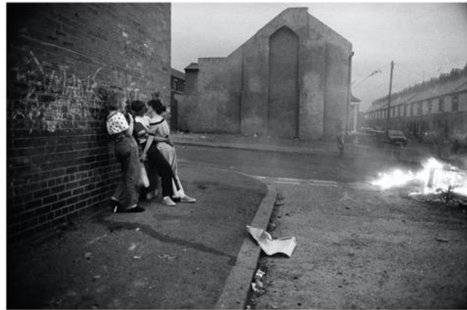
Image 26. Gilles Peress, Whatever You Say, Say Nothing : from the chapter, The Last Night © Gilles Peress