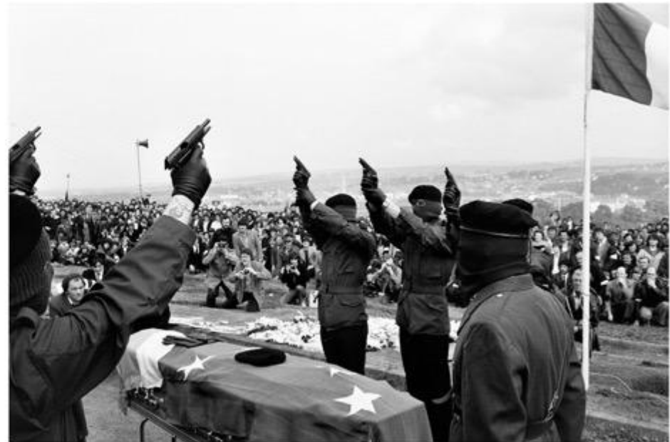
Image 23. Gilles Peress, Whatever You Say, Say Nothing : from the chapter, Prison Days