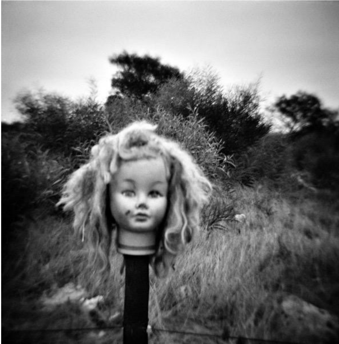
Image 13. Jo Ractliffe, Doll's head , 1990-95 From the series reShooting Diana © Jo Ractliffe