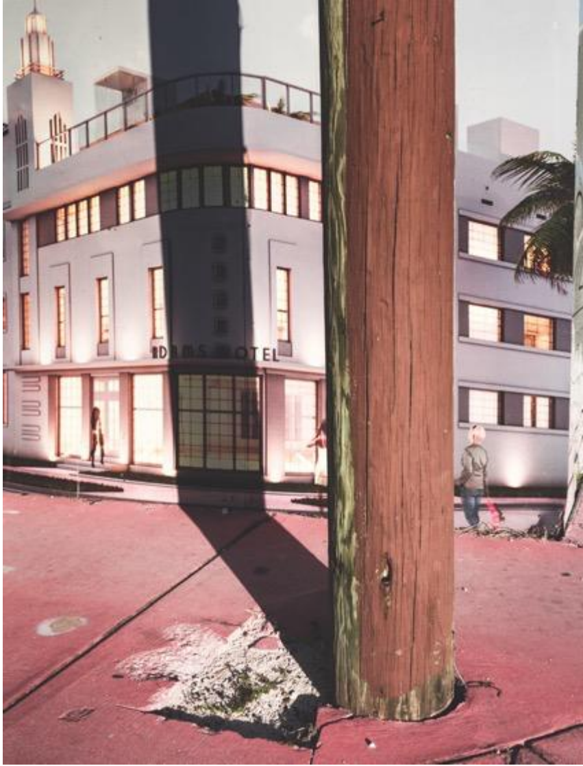
Image 1. Anastasia Samoylova, Park Avenue , 2018, from the series FloodZone © Anastasia Samoylova