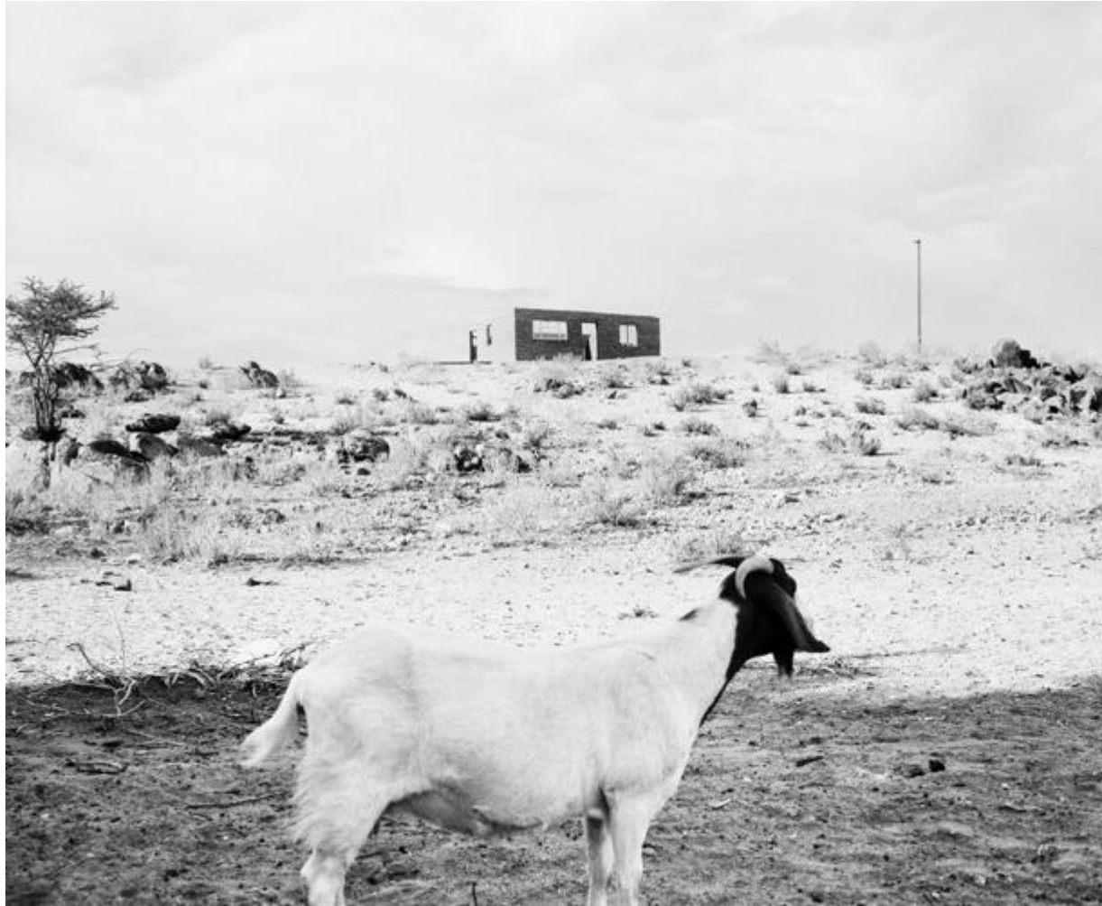
Image 15. Jo Ractliffe, House on the hill, Riemvasmaak , 2012 from the series The Borderlands © Jo Ractliffe