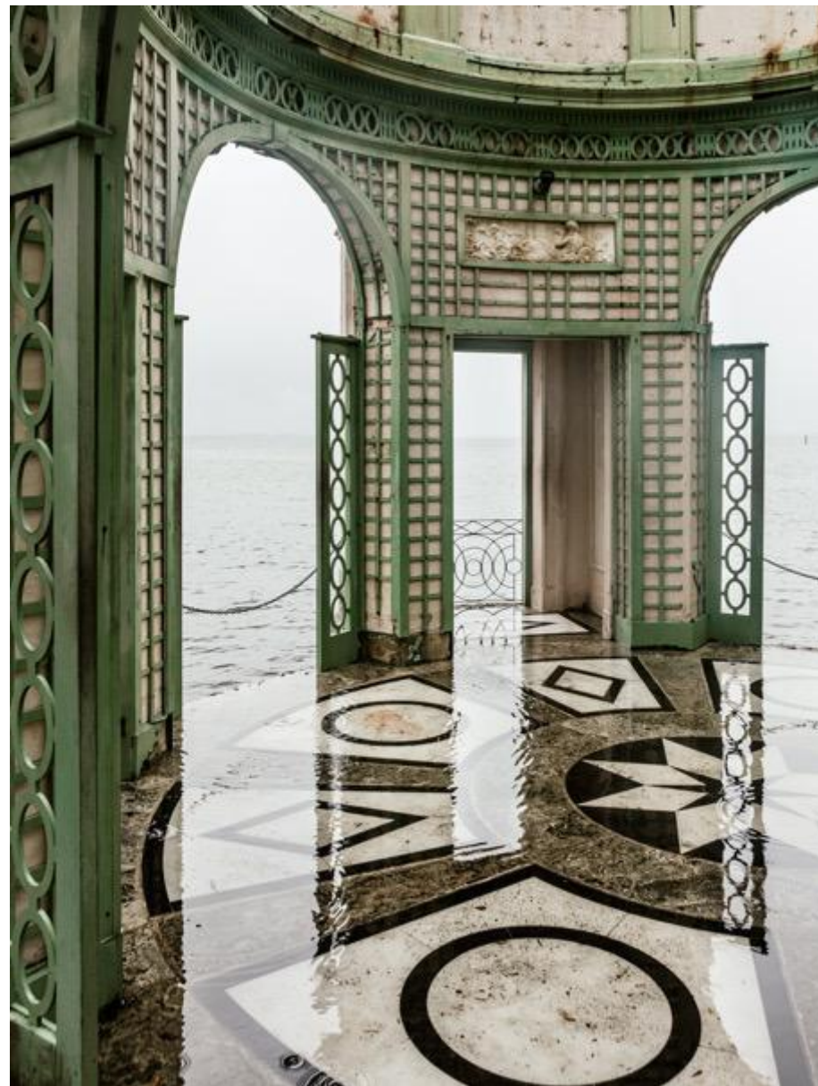
Image 8. Anastasia Samoylova, The Tea Room , 2018, from the series FloodZone