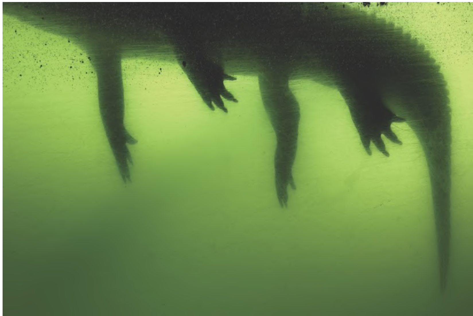
Image 11. Anastasia Samoylova, Gator , 2017 from the series FloodZone