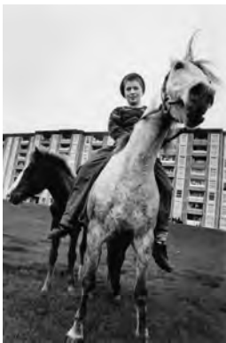
Urban Cowboys, from Urban Cowboys Dublin, 1996

Alternative Text: Black and white photograph of Ian “Lemmy” Kilmister, Micael “Mikkey Dee” Delaoglou and Phil Campbell of the band, Motörhead standing in a corner, posing while smoking cigarettes.