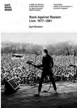
Cover of Rock Against Racism Live: 1977-1981

Alternative Text: Publication cover with a colour photograph of three small girls sitting outside on a doorstep eating ice cream and ice lollies. Two of them have their feet in a blue bucket.