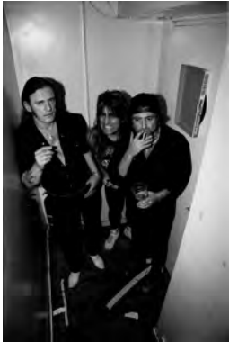
Motörhead, from Motorhead UK , 1997

Alternative Text: Black and white photograph of Ian “Lemmy” Kilmister, Micael “Mikkey Dee” Delaoglou and Phil Campbell of the band, Motörhead standing in a corner, posing while smoking cigarettes.