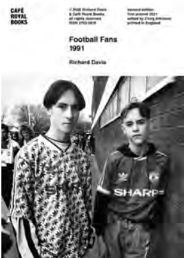
Cover of Football Fans, 1991

Alternative Text: Publication cover with a black and white photograph of two boys wearing Manchester United football shirts stood looking at the camera.