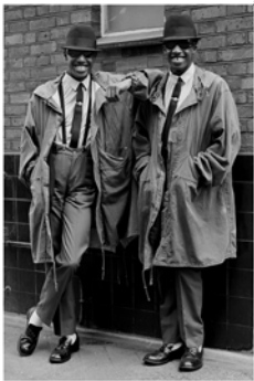
The Islington Twins, from Mods & Rockers Raw Streets UK 1979–1982

Alternative Text: Publication cover with a colour photograph of a young man captured in the middle of jumping in a kitchen painted red and green.