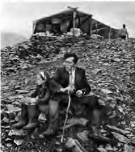
Cover of Ireland 1972-73

CAFE ROYAL BOOKS © 2022 Markéta Luskáčová All rights reserved ISBN 978 1 85143 248 5 First edition edited by Craig Anderson printed in England Ireland 1972–73 Markéta Luskáčová