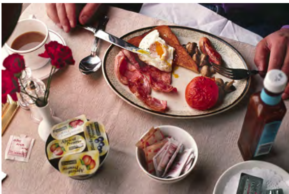
From Being British 1975-2005

Alternative Text: Black and white photograph of a young boy sitting on top of a white horse. Behind them, there is another horse and a row of estate flats.