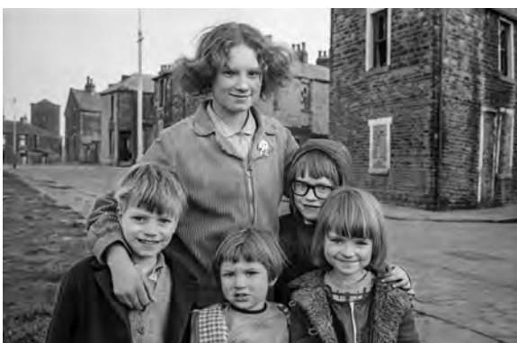
From Burnley 1970s

Alternative Text: Publication cover with a black and white photograph of the corner of an estate with the words "HOUSES STAND EMPTY WHILE HOMELESSNESS GROWS. WHO MAKES THE PROFIT? SOMEBODY KNOWS!" written in white paint along the balconies.