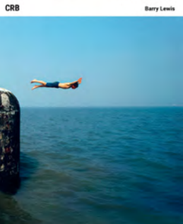
Cover of Being British 1975-2005