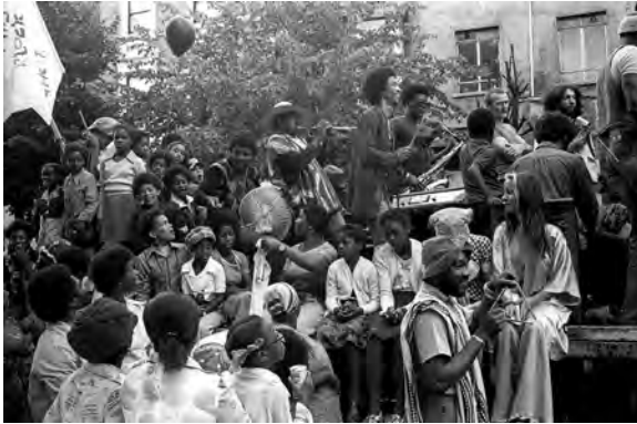
Musical Float, from Notting Hill Carnival, 1974

Alternative Text: Black and white photograph of a large group of children sat on a float, some holding balloons while a number of adults are stood by, with some playing musical instruments.