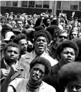
Cover of Black Power Black Panthers, 1969 © Janine Wiedel / Café Royal Books

CAFE ROYAL BOOKS © 2022 Janine Wiedel All rights reserved ISBN 978 1 85143 248 5 First edition edited by Craig Anderson printed in England Black Power Black Panthers 1969 Janine Wiedel