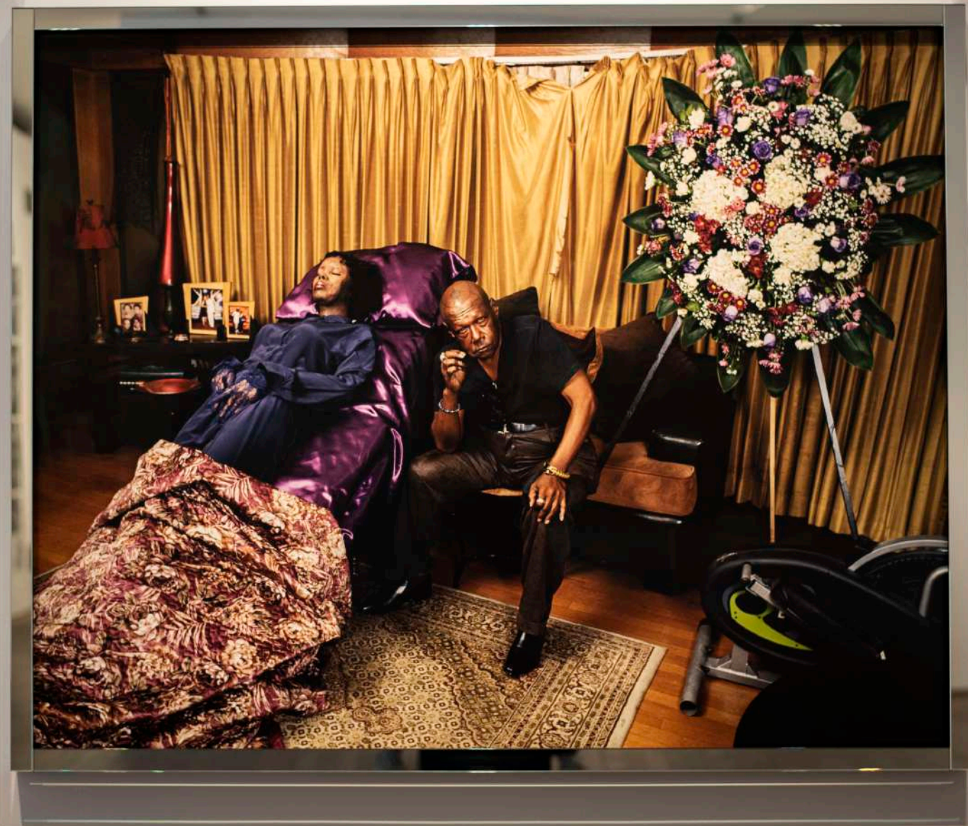
Image 5. Installation image of the Deutsche Börse Photography Foundation Prize 2022 winner Deana Lawson at The Photographers' Gallery, London