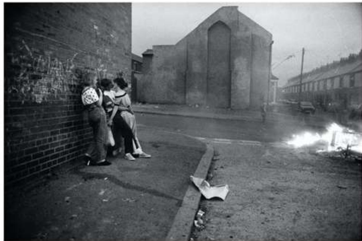
Image 11. Gilles Peress, Whatever You Say, Say Nothing : from the chapter, The Last Night