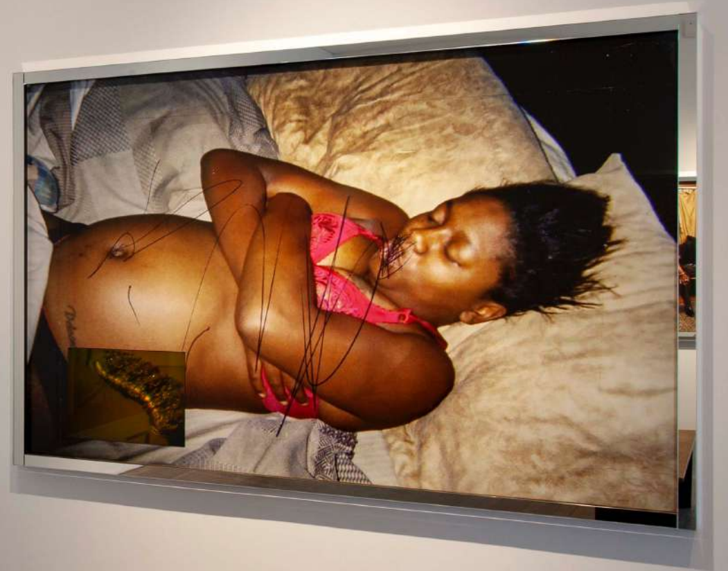
Image 6. Installation image of the Deutsche Börse Photography Foundation Prize 2022 winner Deana Lawson at The Photographers' Gallery, London.