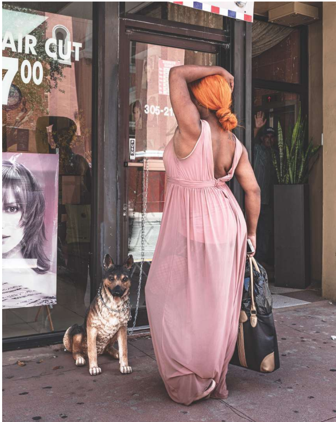
Image 7. Anastasia Samoylova, Barber Shop, Miami , 2018, from the series FloodZone