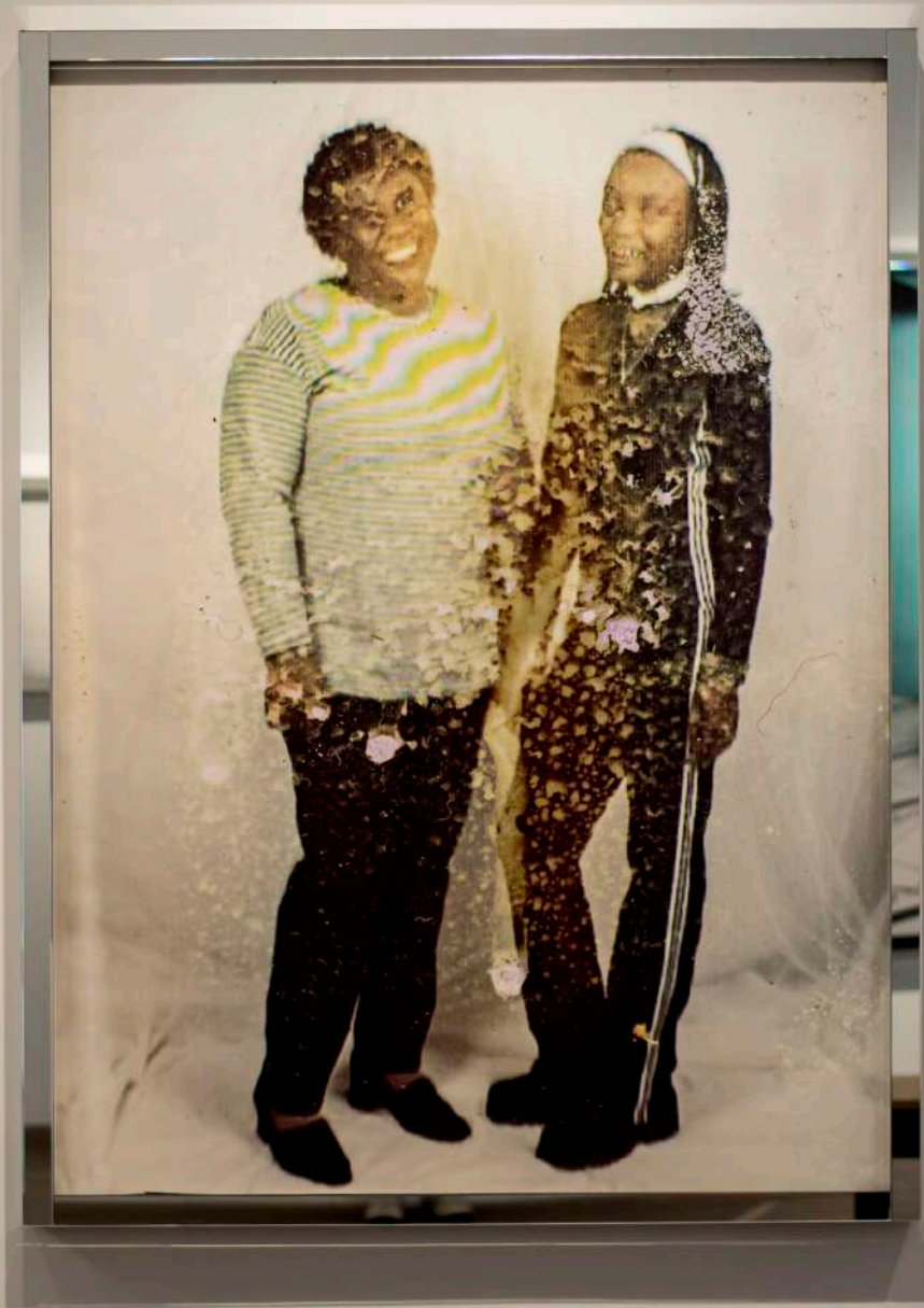
Image 3. Installation image of the Deutsche Börse Photography Foundation Prize 2022 winner Deana Lawson at The Photographers' Gallery, London