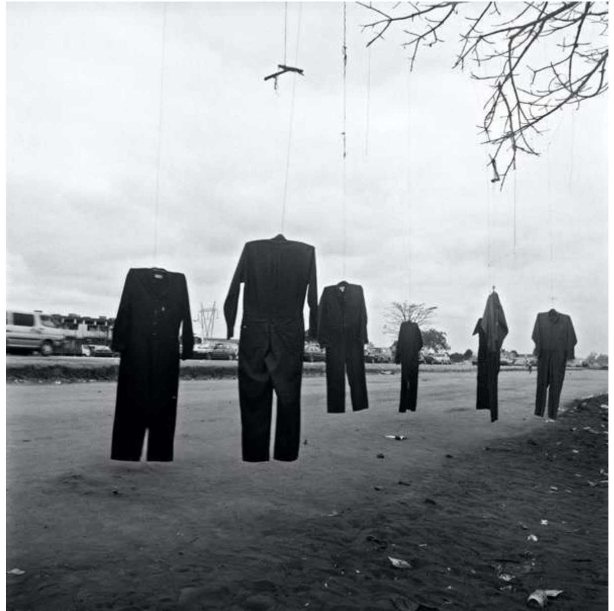
Image 10. Jo Ractliffe, Roadside stall on the way to Viana , 2007 from the series Terreno Ocupado © Jo Ractliffe