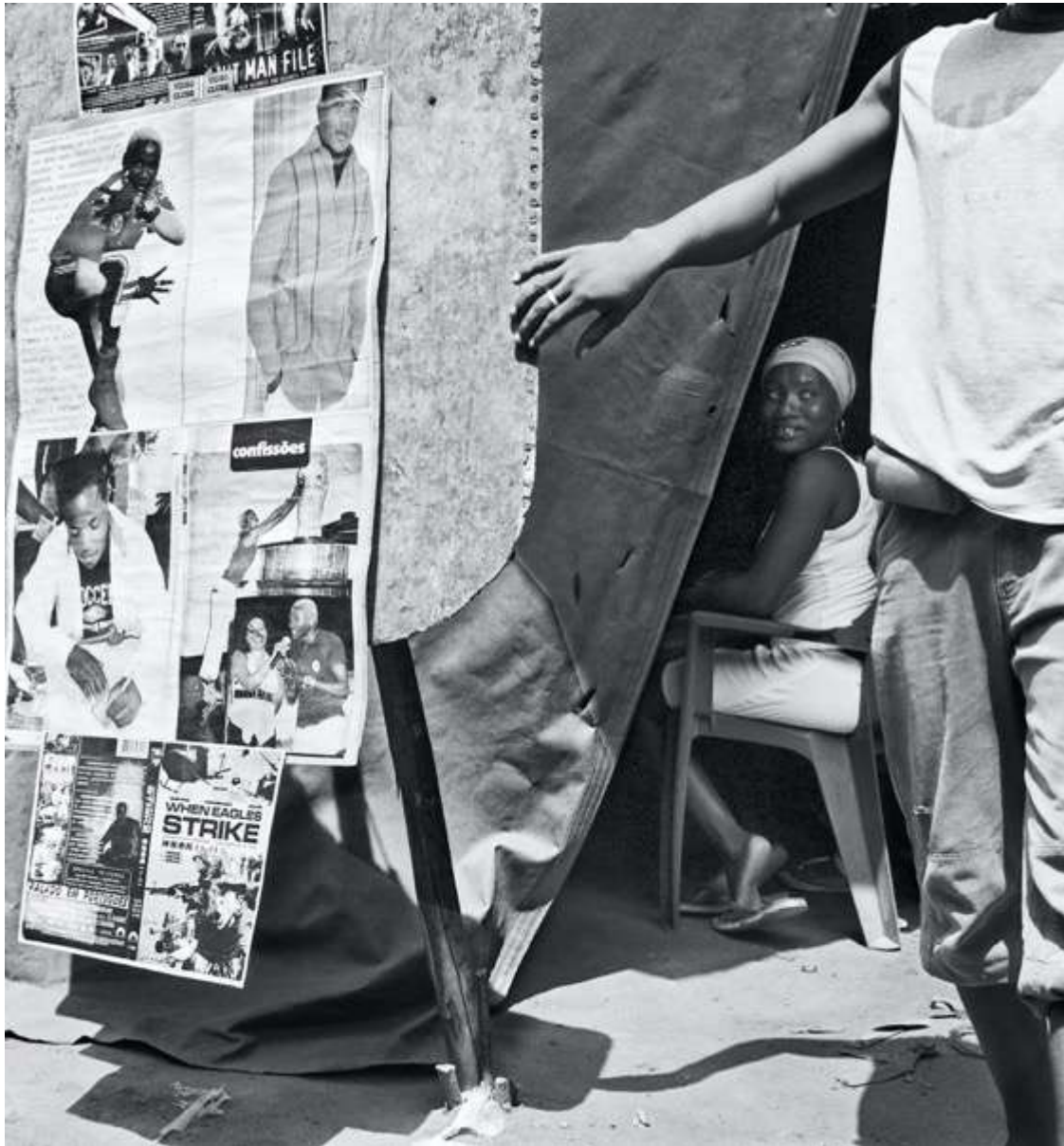
Image 9. Jo Ractliffe, Video club, Roque Santeiro market , 2007 From the series Terreno Ocupado © Jo Ractliffe